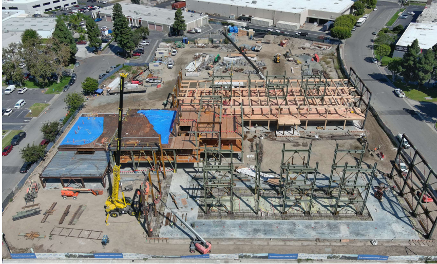
September 19, 2022