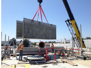
Concrete Launderers Replacement