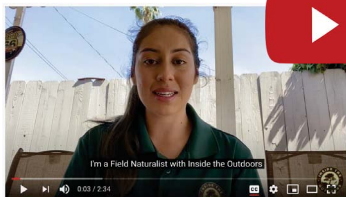
Ways to Reuse Coffee Grounds

Family Missions Translation to Spanish, Korean, Vietnamese & Farsi in progress