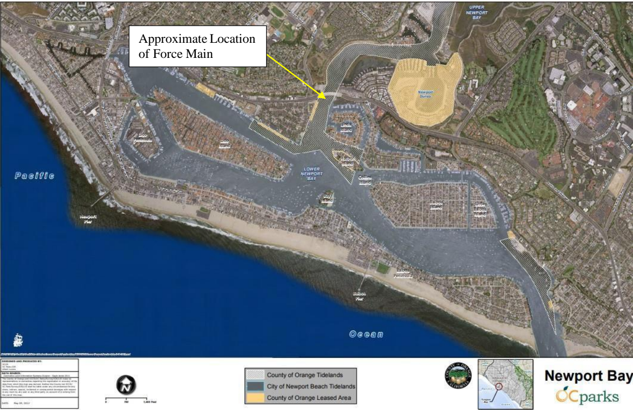
EXHIBIT A Tideland Map