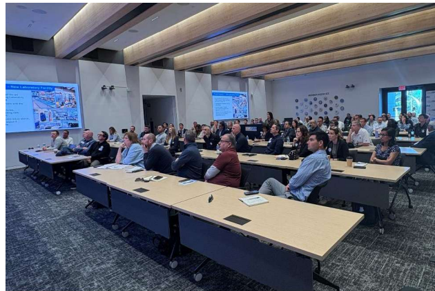
J-133 Industry Forum Event