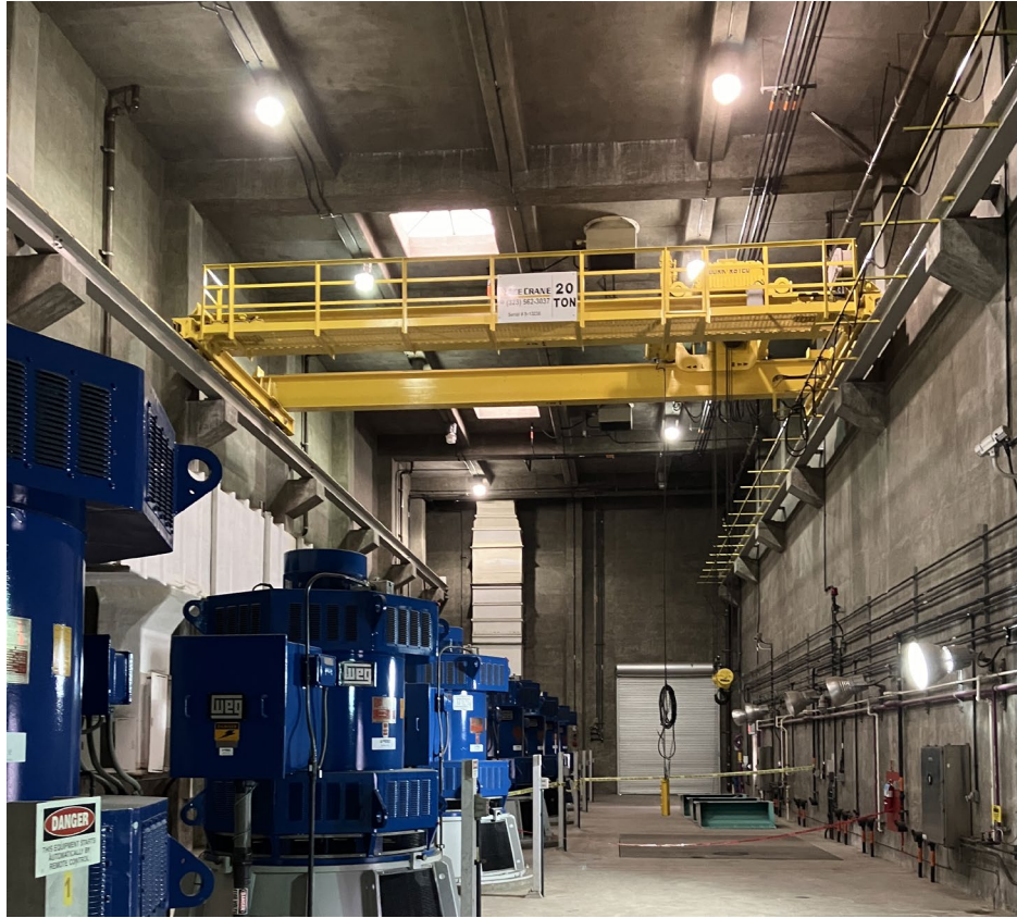
Figure 5: 20-ton Bridge Crane in Influent Pump Station Motor Room (top/ground level)