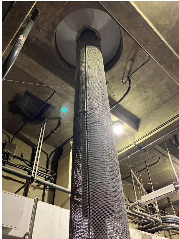
Figure 3 MSP #1 Pump Shaft