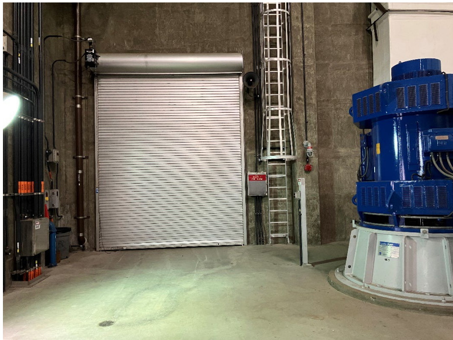
Figure 2: Rollup Door at Influent PS Motor Room (top/ground level) and MSP #1 Motor (on the right)