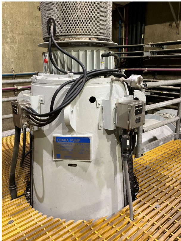
Figure 4 MSP #1 Pump at pump room level (bottom level)