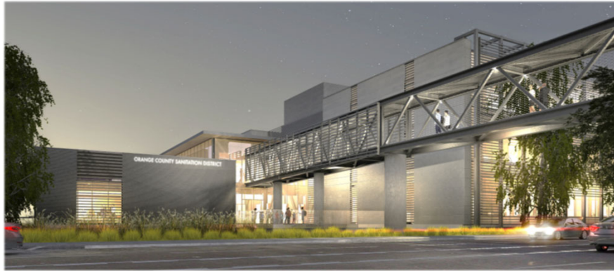
Pedestrian sky bridge over Ellis Avenue connects to Plant No. 1