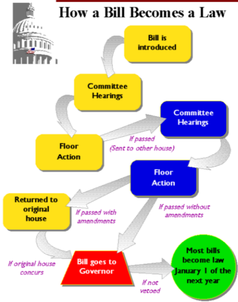
Graphic Obtained from Leginfo.ca.gov